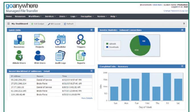
Modern browser-based dashboard for administration.